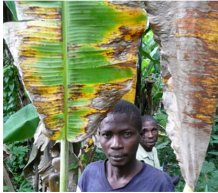
Black Sigatoka disease of banana 1

To enable plant pathologists worldwide to communicate with their peers on all aspects of plant pathology