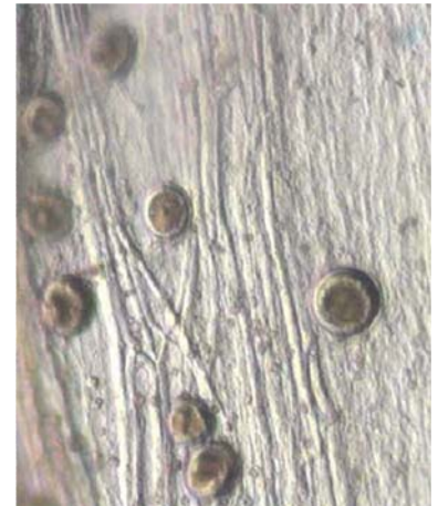
Phytophthora fragariae var. rubra 3